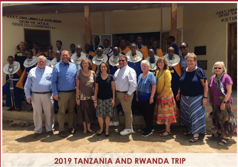
2019 TANZANIA AND RWANDA TRIP